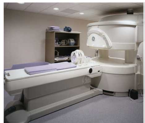
Holy Family Open Speed MRI