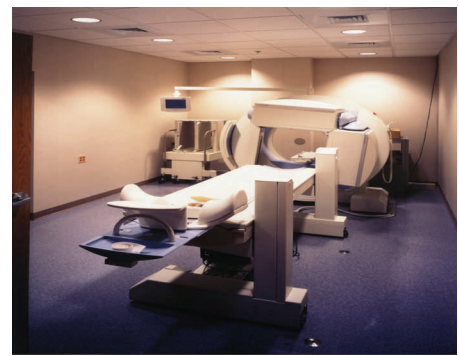
Merrimack Valley MRI