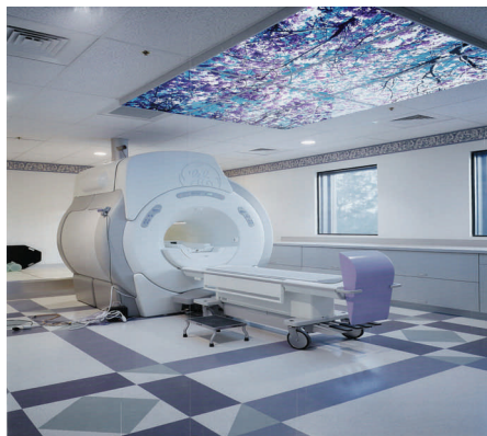
Portsmouth Regional MRI